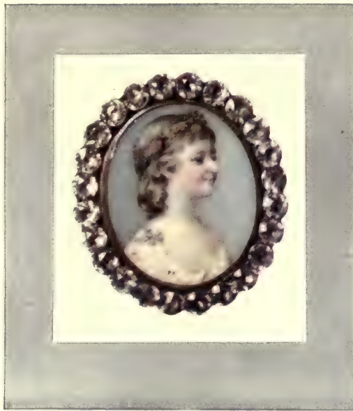
CHARLOTTE, DUCHESS OF ALBANY, DAUGHTER OF CHARLES EDWARD STUART BY CLEMENTINA, TENTH DAUGHTER OF JOHN WALKENSHAW (1753-1789) BY OZIAS HUMPHRY